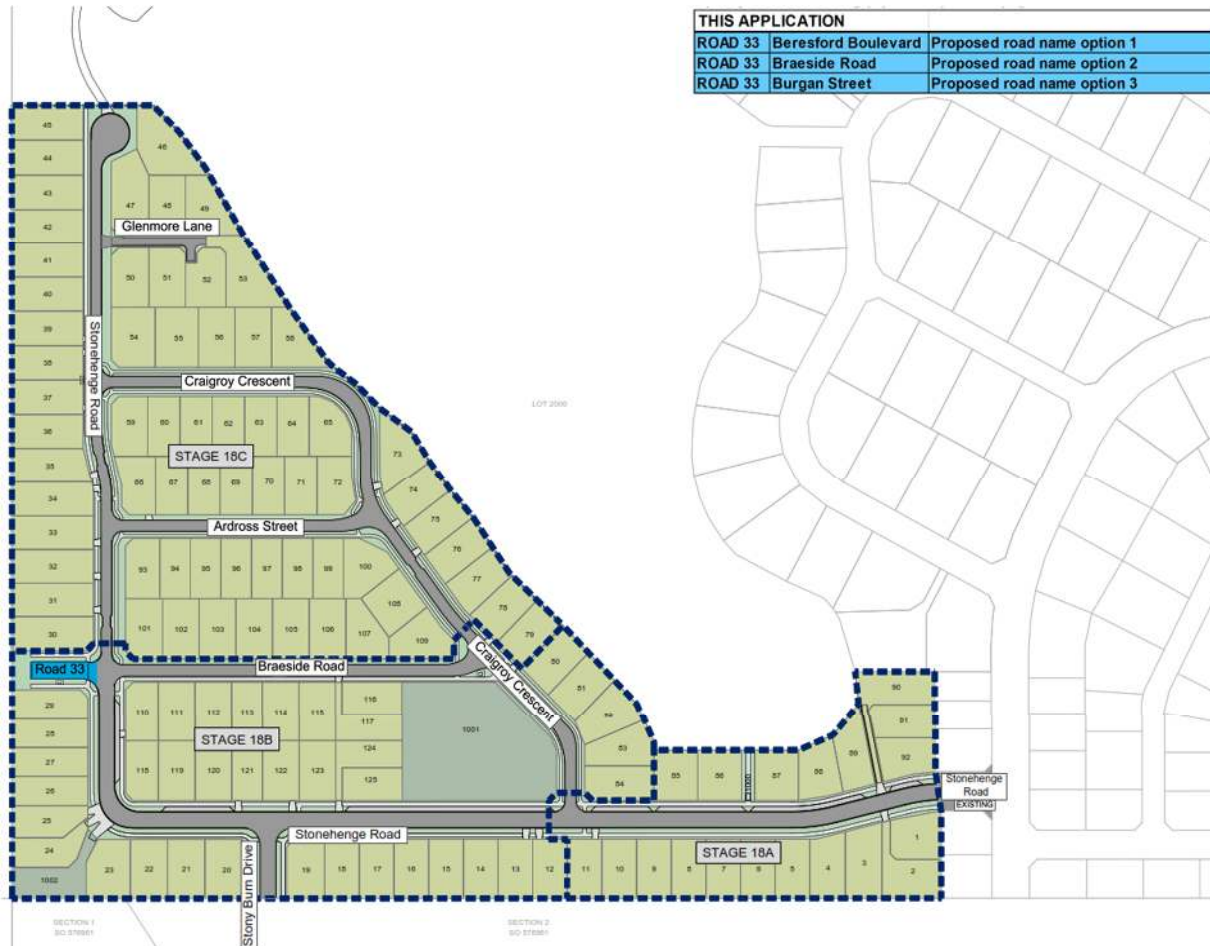
Figure 1: Road Naming Plan (Patersons)

The proposed road name meets the policies of the QLDC Road Naming Policy 2016. Policy 3.1(a)-(f) and the Selection Guidelines (Policy 5) is followed as all of the supporting information, plans and maps is included within this application. Below is an assessment of how the name meets the policy.